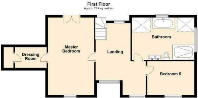
Total area: approx. 222.5 sq. metres